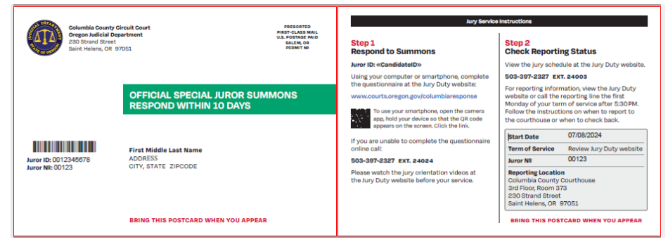
Figure 1 Summons Image

A special summons is used when a jury is needed for an unusually complicated or high-profile trial.